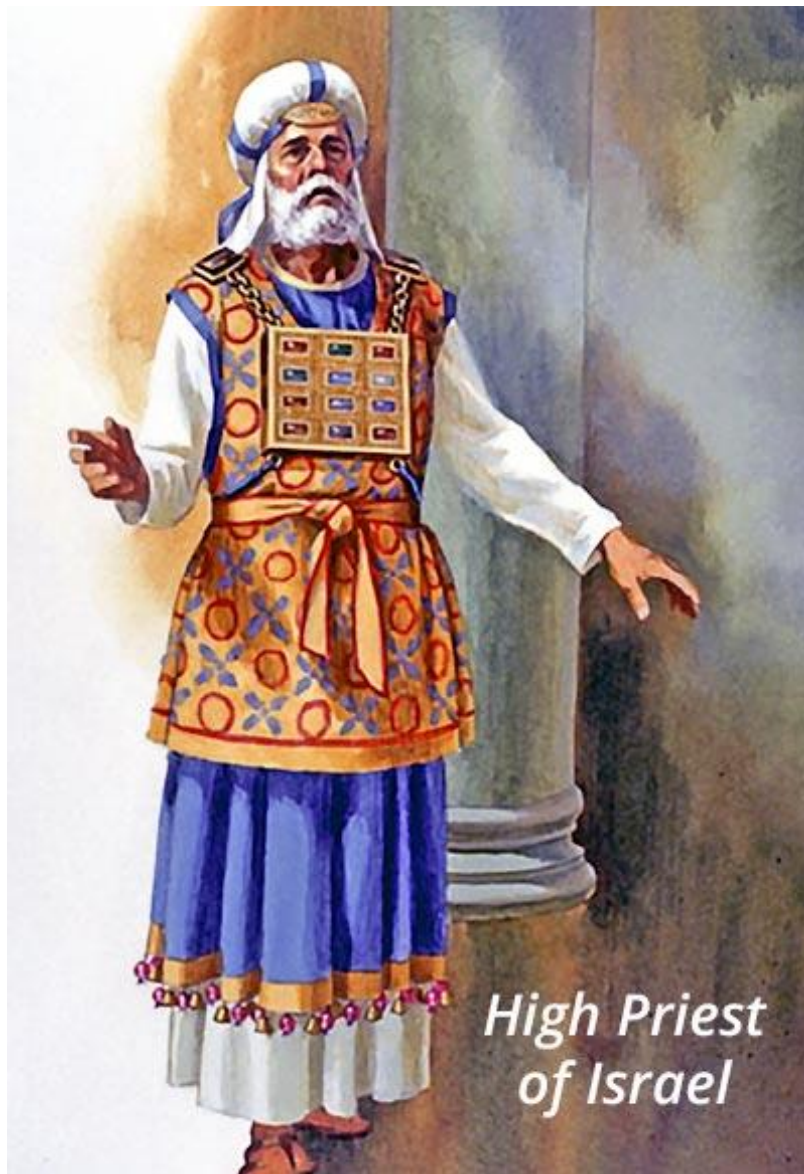
High Priest of Israel